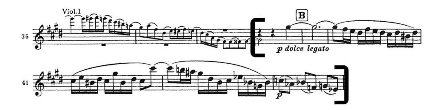
BRAHMS: SYMPHONY NO. 2 MVT. III: BEGINNING TO M. 31